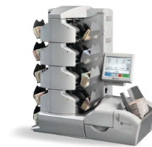
Countertop multi-pocket sorters